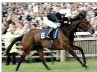
Ouija Board

They have kept the trophy at home six times in the last seven years, but the home team will be up against in this year's edition of the G1 Japan Cup. A third of the 18-horse field set to line up at Tokyo Race Course