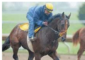
Ministers Wild Cat

Ministers Wild Cat (Deputy Minister--Hollywood Wildcat, by Kris S.), winner of this year's Jacques Cartier S., will stand the 2006 breeding season at Tommy Town Thoroughbreds in Santa Ynez, according to the Daily Racing Form . His fee has been set at $7,500. Winner of the Golden State Mile S. and runner-up in the GIII El Camino Real S. and the GIII Affirmed H. during his sophomore season, the bay re-