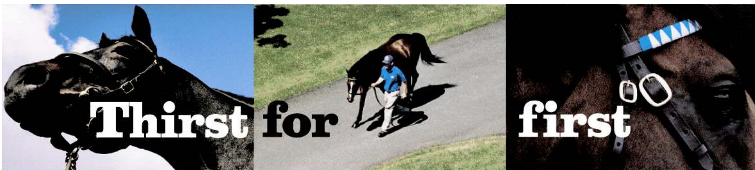
Cape Cross €50,000 Oct 1, SLF Leading first-crop sire, 2003

The brisnet.com 'Race of the Day' is the 9th Race, $24,000 Allowance, at Calder. For pps and a complete race analysis, click here .