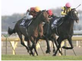
Alkaased (outside)

British invader Alkaased (Kingmambo) showed the heart of a champion to deny the late-running Heart's Cry (Jpn) (Sunday Silence) in a thrilling finish to the 25 th