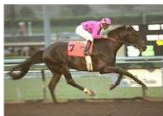
Tizbud

Tizbud (Cee's Tizzy-Cee's Song, by Seattle Song), a stakes-winning full brother to 2000 Horse of the Year and leading freshman sire Tiznow, has been relocated to Harris Farms in Coalinga, California. He will stand the upcoming breeding season for a fee of $3,000. Tizbud entered stud in 2005 at Jubilee Farms in Florida, where he stood for $5,000. The six-year-old was offered for sale at the most recent Keeneland November