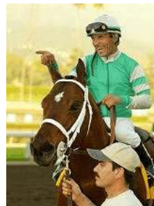
Saint Afleet