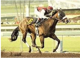
Ruler's Court

RULER'S COURT TO VINERY FLORIDA Ruler's Court (Doneraile Court--Future Guest, by Copelan), a dominating 14-length winner of the GII Norfolk S. in 2003, has been retired and will take up stud duties at Vinery Florida. The four-year-old will stand as property of Darley for a fee of $5,000, live foal. Purchased by Darley for $400,000 as an OBS February juvenile in 2003, Ruler's Court went on to be co-highweighted on the Experimental Free Handicap that year. One of the winter book favorites for the Kentucky Derby, he suffered an injury while training in Dubai that forced him to miss his three-year-old season. He returned the races in 2005, capturing a Belmont allowance race in September. Ruler's Court concludes his career with a record of 8-3-1-1, and earnings of $235,900.