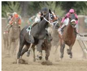
2005 Preakness