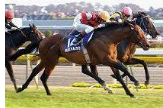
Alkaased Winning Japan Cup www.jair.jrao.ne.jp