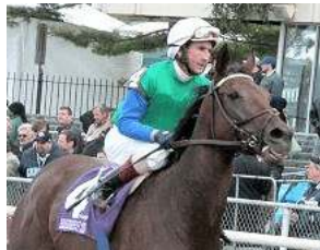
Sand Springs Sherackatthetrack