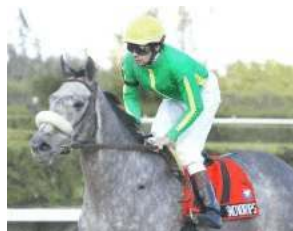
Snowdrops