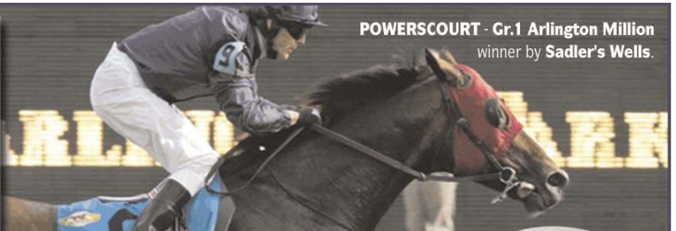
POWERSCOURT - Gr.1 Arlington Million winner by Sadler's Wells.