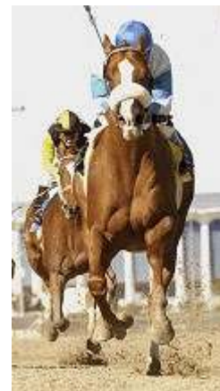
Bordonaro