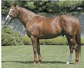
High Yield www.stallionregister.com

HIGH YIELD TO FRANCE Sophomore sire High Yield (Storm Cat--Scoop the Gold, by Forty Niner) will head to Haras de la Haie Neuve in France for the 2006 breeding season. A stud fee has not yet been announced. The multiple Grade I winner, who began his stud career at Ashford Stud in Kentucky, had previously been scheduled to stand the upcoming season at Hill 'n' Dale Farm for $7,500. High Yield's top performer from his first crop is the multiple stakes winning three-year-old filly Amazing Buy .