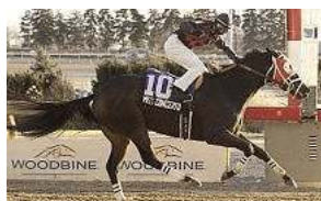
Miss Concerto

Miss Concerto was claimed for $50,000 out of a third-place finish on the Woodbine turf July 31. The