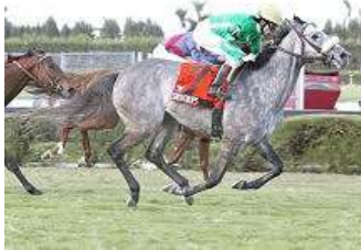
Snowdrops