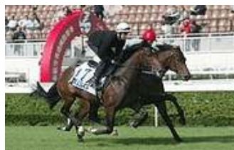
Hip 17

Danehill's lone two-year-old in today's auction figures to attract his fair share of attention. Catalogued as hip