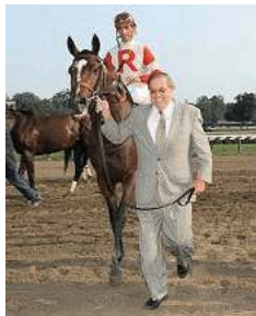
Nothing To Lose