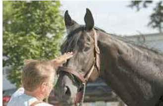
Rock Hard Ten