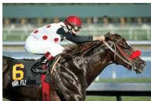
High Fly