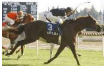
A Bit O'Gold

TRIO OF BRONZE FOR GOLD Two Bit Racing Stable's A Bit O'Gold (Gold Fever) was the big winner at Friday night's Sovereign Awards ceremony at the Wyndham Bristol Place Hotel in Toronto, taking down honors as Canadian Horse of the Year as well as champion older male and champion turf male. Trained by