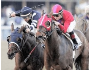
Diplomat Lady (inside)

On a day that saw a huge price in Aqueduct's GIII Gravesend H., 39-1 Diplomat Lady (Forestry) offered up a sizeable upset of her own, handing favored Balance (Thunder Gulch) a half-length