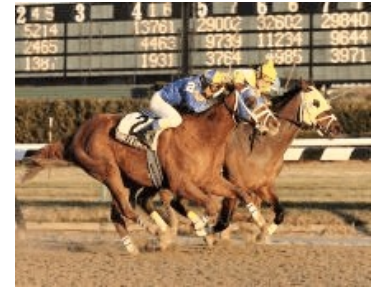
A resurgent Banjo Picker (yellow blinkers) denies Pioneer Empire A Coglianese