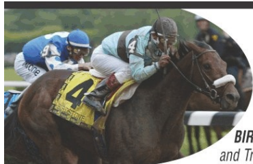
BIRDSTONE , 2004 Belmont-G1 and Travers-G1 winner.