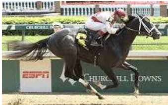
Half Ours