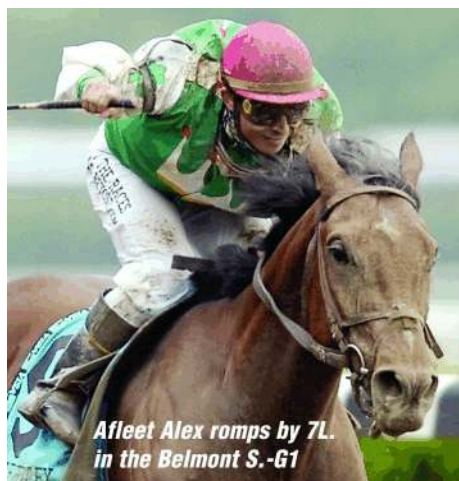
Afleet Alex romps by 7L in the Belmont S.-G1