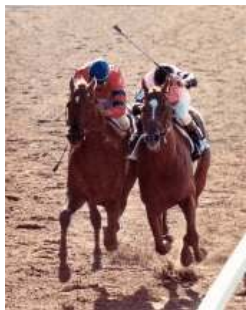
Alydar & Affirmed

Even in his prime, Alydar had a reputation for being more of a filly sire, thanks largely to the magnificent start he made with his outstanding first-crop daughters Althea and Miss Oceana. Although he soon added further Grade I-winning fillies to his tally in the form of Alydar's Best, Endear, Clabber Girl, I'm Sweets and Cadillacing, he wasn't long in showing that he could also get top-class sons. His second crop was headed by Saratoga Six and Turkoman, with Turkoman becoming the first of three sons of Alydar to take the title of champion older horse. The other two, Alysheba and