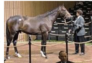
Keeneland's $9.7 million Storm Cat - Tranquility Lake

The six-year-old continued to reward that patience, adding further Grade II successes in the Del Mar H. and Goodwood Breeders' Cup H. Ankle surgery then put Benchmark back on the sidelines in 1998, but his debut at stud coincided with the emergence of his very talented half sister Tranquility Lake. This daughter of Rahy became a Grade I winner in the Gamely Breeders' Cup H. and later took the Yellow Ribbon S. Tranquility Lake hit the headlines again this year when her second foal, by Storm Cat, fetched a jaw-dropping $9.7 million at Keeneland. Cont. p3