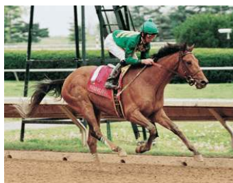
Midway Road www.lanesend.com