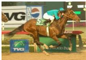
Brother Derek winning the Hollywood Futurity

That colt was obviously bought with a view to eventually becoming a major stallion, so his buyers must be encouraged by Benchmark's achievement of siring two Grade I winners. Brother Derek's predecessor is Silent Signs, who inflicted the first defeat on Halfbridled in winning the Santa Anita Oaks. Benchmark has also sired the Grade II scorer A to the Z and the Grade III winner Standard Setter, with his four graded winners coming