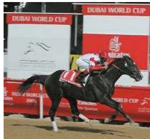
Roses in May '05 Dubai World Cup winner