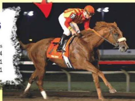
SHAMOAN won Iowa Derby (L) and 2nd Lone Star Derby (G3).