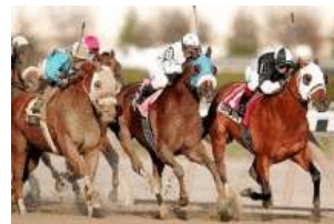
Attila's Storm (rail)