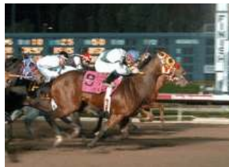
Value the Man (#8)

Value the Man's Futurity win came at the expense of the brilliant filly Higher Fire, who was looking to complete the 'Los Alamitos Bonanza,' which offered a $1-million bonus to any juvenile who could sweep the GI Ed Burke Futurity, GI Golden State Futurity and the Los Alamitos Million Futurity.