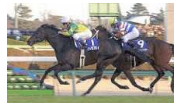
Zenno Rob Roy beats Tap Dance City in 2004