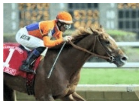
Greeley's Galaxy Four-Footed Foto