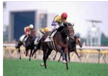
Deep Impact winning the Derby jair.jrao.ne.jp