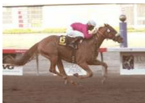
Flying Continental