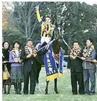
Arima Kinen Winner's Circle