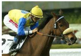
The Tin Man

THE TIN MAN RETURNS The Tin Man (Affirmed), who turns eight on New Year's Day, will make his first start in nearly 15 months in the sixth race at Santa Anita Wednesday. The millionaire gelding has won