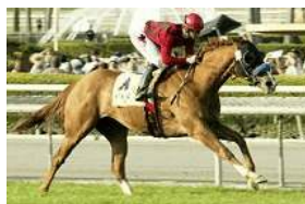
Shining Energy