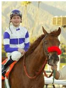
Sharp Lisa