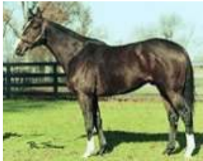
Catienus

CATIENUS TO HIGHCLIFF One of the nation's leading sophomore sires, Catienus (Storm Cat) will return to Highcliff Farm in New York to stand for a