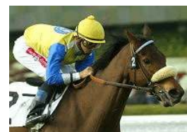
The Tin Man