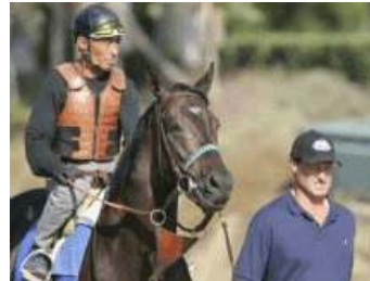
Declan's Moon &

Former two-year-old champion Declan's Moon (Malibu Moon) received his final major preparatory work at Hollywood Park yesterday in advance of Saturday's GII San Pasqual H. at Santa Anita. Posting the second fastest of 133 moves Sunday, the five-year-old completed five furlongs in a crisp