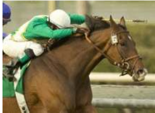
King's Theatre Benoit