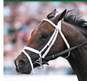
Introducing BLUEGRASS CAT

Sunday, Monday & Tuesday, January 7, 8 & 9 11 a.m. to 3 p.m. • Refreshments will be served