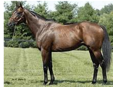
Midas Eyes

Touch Gold, the sire of Bayou Lassie's half-brother Midas Eyes, and Outflanker do have some pedigree features in common, as both are by Northern Dancer- line stallions out of mares with Buckpasser close up in their pedigree. The mating represents the Danzig/Hoist the Flag cross, which has also produced Grade I winners Shaadi, Imperial Gesture, Librettist and Cindy's Hero. We can also note that Bayou's Lassie is linebred to Turn-to and My Babu (the paternal and maternal grandsire of Gay Missile, the third dam of Outflanker). Turn-to and My Babu are always interesting in combination as they share a granddam (the major tap-root mare, Lavendula), and My Babu's broodmare sire, Badruddin, is a 3/4-brother to Mumtaz Begum, the granddam of Turn-to's sire, Royal Charger.