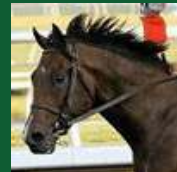
Introducing SHARP HUMOR