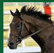
Introducing SHARP HUMOR