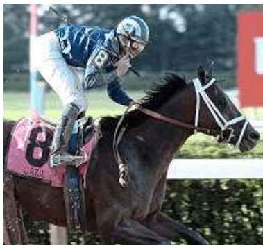
Jazil