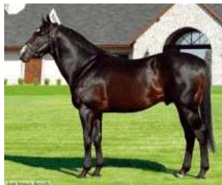
Honour and Glory

Honour and Glory (Relaunch-Fair to All, by Al Nasr {Fr}) has arrived at Wintergreen Stallion Station in Midway, Kentucky, where he will stand for $12,500 in 2007. Purchased by La Mission Stallion Station in Argentina from Ashford Stud last year, Wintergreen has entered into a long term lease with La Mission for the Northern Hemisphere season.