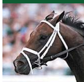
Introducing BLUEGRASS CAT

Sunday, Monday & Tuesday, January 7, 8 & 9 11 a.m. to 3 p.m. • Refreshments will be served