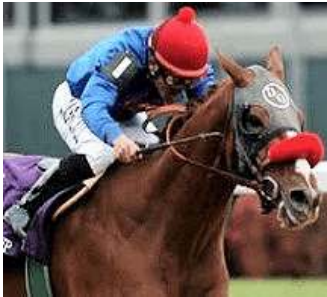
Thor's Echo

Thor's Echo (Swiss Yodeler), winner of the GI Breeders' Cup Sprint and GI Frank J. De Francis Memorial Dash in November, has been purchased by the