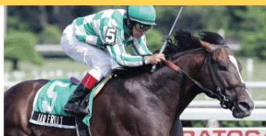
New for 2007 • WAR FRONT