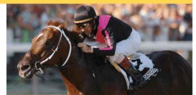
New for 2007 • FIRST SAMURAI