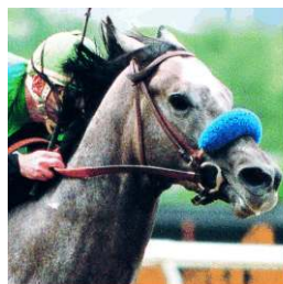
Champion & G1 Winner at 2...Smoke Glacken