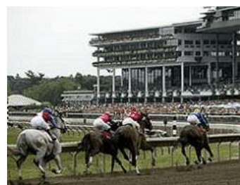
Turning for home at Monmouth

nominator participation than at any time in the event's history, all designed to attract the best horses from around the world to compete in the Breeders' Cup World Championships." The races are the first to be added to the Breeders' Cup program since the F/M Turf was inaugurated in 1999. In addition to the three new Breeders' Cup races, three will be three other stakes on Friday's card that will be funded by the Breeders' Cup; each will carry a purse of $250,000. They are: a race for three-year-old fillies at 1 1/16 miles; a one-mile race on the turf for juvenile fillies; and a six-furlong race for two-year-olds. Cont. p2