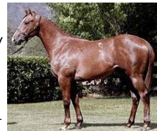
Lot 91 - A$580,000 Exceed and Excel (Aus) colt