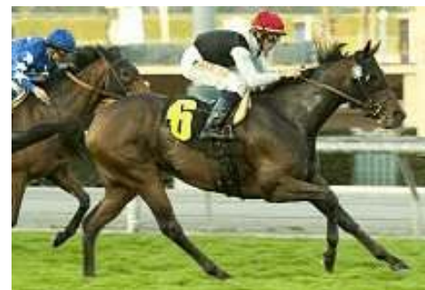
Summer Scent's 3/4-sister Society Hostess winning the GIII Monrovia H. Jan. 1