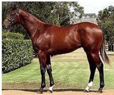
Lot 83 - A$1.5 million colt

The sale complex at Magic Millions has been the scene of frenetic activity in recent days, and that action translated into a robust first session bolstered by the spending spree of prominent