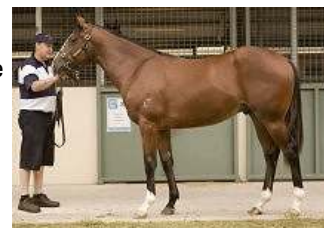
Lot 376 Magic Millions photo