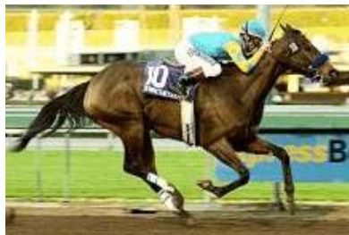
Downthedustyroad