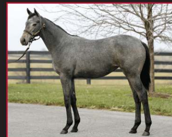
Filly (gr/ro, 3/14/06) o/o Doradoradora, by Runaway Groom. Bred by Keithshire Farm