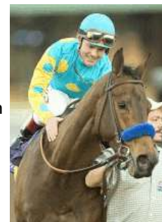
Downthedustyroad after the La Brea