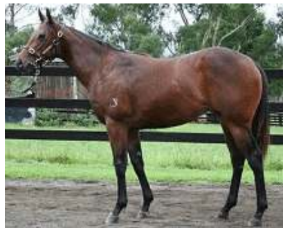
Lot 124 - Thursday's top filly Encosta de Lago--Merlene

The sale continued to gain momentum throughout the day as a predominantly domestic bench more than held its own against buyers from South Africa, led by Laird, and a sprinkling from Hong Kong. The aggregate was up some A$12 million and the average was up by A$55,000 to A$187,131. South African trainer Charles