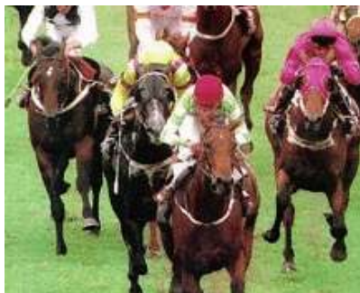
Merlene winning the G1 Golden Slipper in 1996