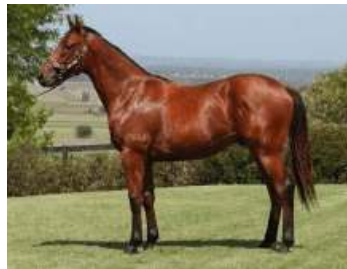
Lot 560 magicmillions.com.au