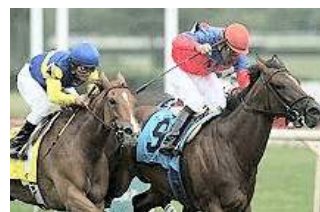
Angara

Swettenham Stud's Angara (GB) (Alzao--Ange Bleu, by Alleged) has been retired from racing and will bred to Coolmore stallion Montjeu (Ire) in 2007. Bred by the