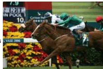
Kastoria (foreground) just misses in Hong Kong