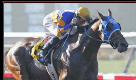
KELA: $7,500 LIVE FOAL

All are Grade 1 winners, by a son of Mr. Prospector, standing in Kentucky for 2007