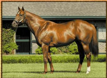
A TAYLOR MADE/WINSTAR VENTURE STANDING AT WINSTAR: (859) 873-1717 2007 FEE- $40,000 LIVE FOAL

news from STAKES WINNING and/or STAKES PRODUCING MARES will be published. Thanks for your cooperation.