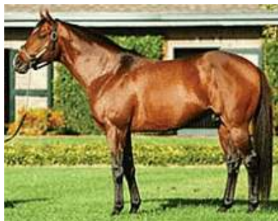
Victory Gallop www.winstarfarm.com

OLD TRIESTE MARE TOPS OBS FRIDAY Spencers Storm (Old Trieste--Cindy's Quest, by Storm Cat), a six-year-old broodmare in foal to Victory Gallop,