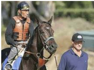
Declan's Moon &

Declan's Moon (Malibu Moon), looking to regain his 2004 championship form, is the headliner in today's second race at Golden Gate, a one-mile allowance. The