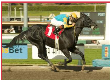
E Z WARRIOR - Jan. 7 1st San Miguel S.