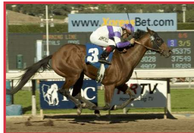
NOTIONAL - Jan. 13 1st San Rafael S.-G2