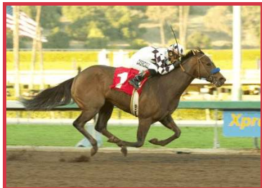
JUMP ON IN - Jan. 15 1st Santa Ynez S.-G2