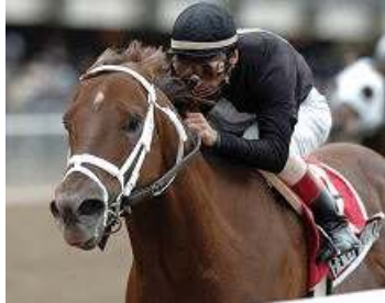
Friendly Island

Friendly Island (Crafty Friend) may be enjoying the California sunshine this winter, but it will be a working holiday for the New York-bred six-year-old. Freshened after running second as a 56-1 outsider in the GI Breeders' Cup Sprint at Churchill Downs Nov. 4, he returns to action against three rivals in the GII Palos Verdes H. at Santa Anita this afternoon. The Anstu Stables color-bearer won six of his first nine career starts, including the Hudson H. in October of