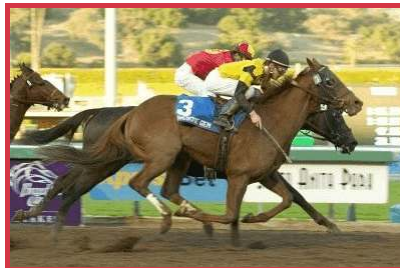
AWESOME GEM - Jan. 13 1st San Fernando S.-G2