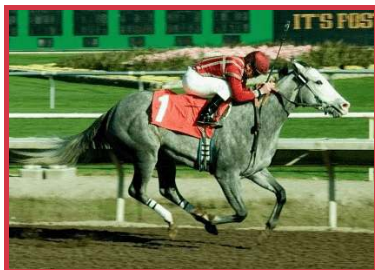
GLORIFICATION - Jan. 13 1st Tiburon H.