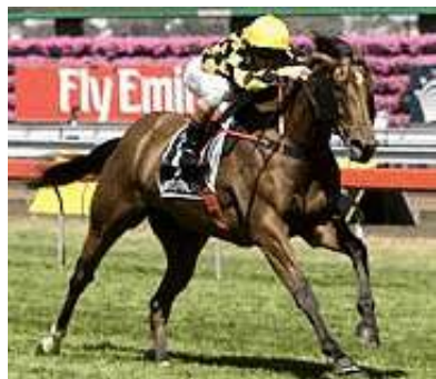
Miss Finland

MISS FINLAND BOUND FOR DUBAI? A tilt at the Mar. 31 G1 Dubai Duty Free at Nad al Sheba has not been ruled out for champion Miss Finland (Aus) (Redoute's Choice {Aus}), the only filly ever to com-