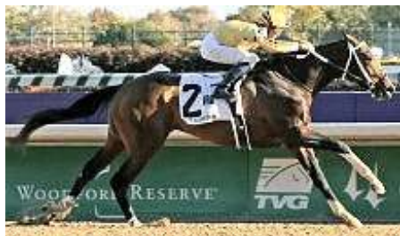
Tiz Wonderful at Churchill