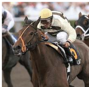
Any Limit