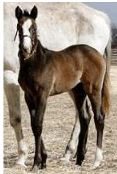
Hip 1063 as a foal

DREAM RUN FILLY TOPS OBS FINALE A yearling filly by Dream Run out of GSW Rosie O'Greta (Fight Over) attracted a final bid of $45,000 to top the closing