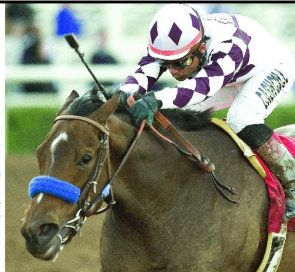
2007 Santa Ynez-G2 winner JUMP ON IN earned 2006's top Beyer by a 2yo debut filly.