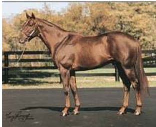
Crafty Friend

Friendly Island's sire, Crafty Friend, was another horse whose record improved with age, and it's a promising sign for Friendly Island, that he enjoyed his most lucrative campaign at the age of six. Crafty Friend did