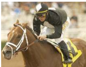
Friendly Island

The victor, Friendly Island, who is now closing in on the $1-million earning mark, has been a progressive sort. Unraced at two, his most prestigious victories at three and four came in successful renewals of the Hudson H., a race restricted to New York-breds. Last year, Friendly Island began to make his mark in graded stakes company, and after a win in the GIII Maryland Breeders' Cup Sprint H., and placings in three other graded events, including a third in the GI Forego H., he closed out the season with a second in the GI Breeders' Cup Sprint. Having