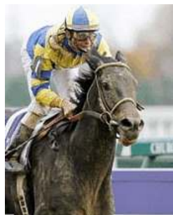
Street Sense