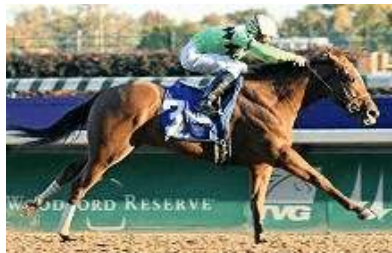
Change Up

Graded-stakes winner Change Up (Distorted Humor) is out of action after undergoing knee surgery, according to Daily Racing Form .