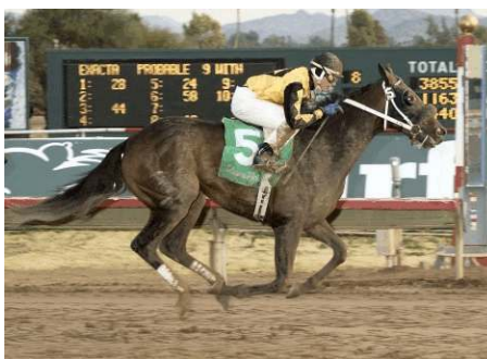
SLEW O' PLATINUM

TWO NEW STAKES HORSES THIS MONTH FOR STEPHEN GOT EVEN (A.P. Indy – Immerse)