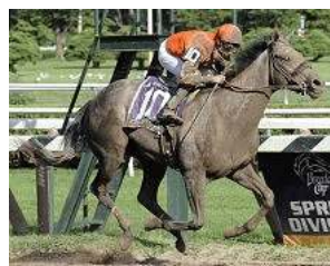
Swap Fliparoo

‘SWAP’ DRILLS FOR F/M SPRINT Swap Fliparoo (Exchange Rate) showed she was ready for Saturday’s Sunshine Millions Filly and Mare Sprint with a three-furlong blowout in :35 2/5 yesterday at Gulfstream