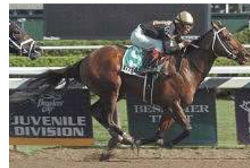
Chace City (2004-2007)