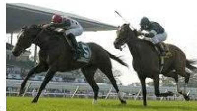
Miesque's Approval at Monmouth

APPROVAL Recently crowned turf champion Miesque's Approval (Miesque's Son) worked five-eighths at Calder in 1:03 3/5 yesterday in preparation for his seasonal bow, the GIII Canadian Turf H. Feb. 3 at Gulfstream. He is expected to face Eclipse finalist and Canadian Turf defending titlist