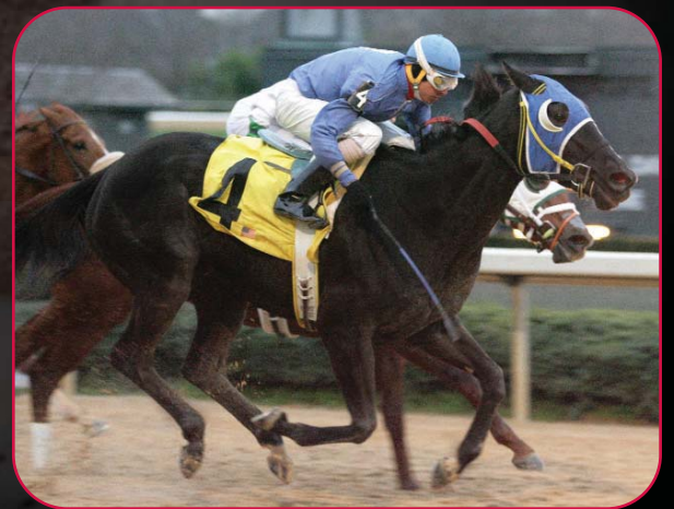
COUNTRY DIVA, American Beauty S.

(#1 in crop by 2006 Rate of Return on weanlings)