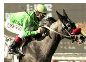
Cambiocorsa