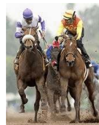
Mistical Plan (shadow roll)