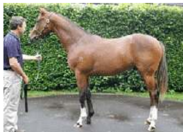
Stravinsky - Ethereal NZ$1.3 million topper

STRAVINSKY COLT TOPS KARAKA DAY 1 The New Zealand Bloodstock's two-day Premier Yearling Sale at Karaka kicked off Monday in record-breaking style, with a colt by Stravinsky out of the champion