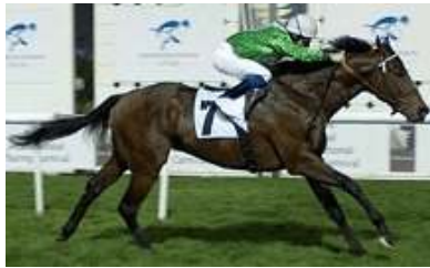
Touch of Land