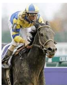
Street Sense