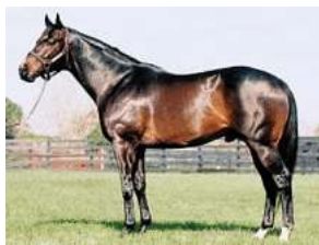
Put It Back