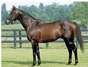
Taste of Paradise stallionregister.com