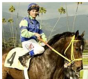
Arson Squad

A look at the 2006 leading sires list for Europe underlines the remarkable degree of dominance that Danzig