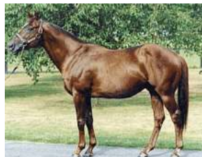
Horse Chestnut