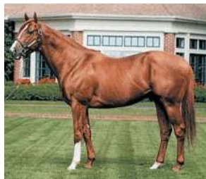
City Zip

Two stallions who started out in New York and a Canadian stallion also registered A Runner indices of 2.99 or better through the end of 2006. Ghostzapper's half-brother City Zip has followed the Belong To Me route, and was moved to Lane's End in Kentucky, though in his case it was before his two-year-olds had even run. They weren't wrong, though. He ranked third on the 2005 North American Freshman Sire list, and finished sixth in progeny earnings among