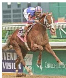
Circular Quay

A full field of three-year-olds hoping to punch their ticket to the Triple Crown trail will enter the starting gate of today's GIII Risen Star S. at Fair Grounds. Circular Quay (Thunder Gulch) was the most accomplished