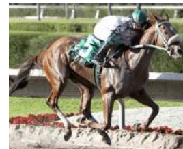
Meditations