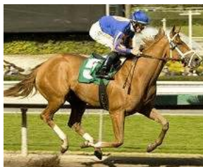
Rags to Riches

A competitive field of nine three-year-old fillies are slated to contest the GI Las Virgenes S. at Santa Anita today, including a pair of Grade I winners and two additional graded-stakes winners. At the other end of the spectrum is Rags to Riches (A.P. Indy), who is stepping up from an impressive six-length maiden win Jan. 7 at Santa Anita ( video ). The $1.9-million KEESEP yearling purchase is a half-sister to GI Belmont S.