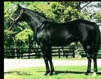
Devil His Due