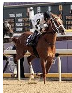
Dreaming of Anna