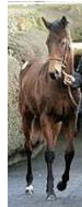
Lot 438