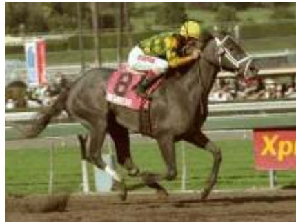
Millionaire Smok'n Frolic, a full sister to yesterday's topper

Last year, Darley Stable made just one purchase at OBS February, but made it count with the acquisition of the $650,000 topper, Media City. Sheikh Mohammed's operation was again in surgical strike mode at yesterday's OBS Selected Two-Year-Olds in Training sale,