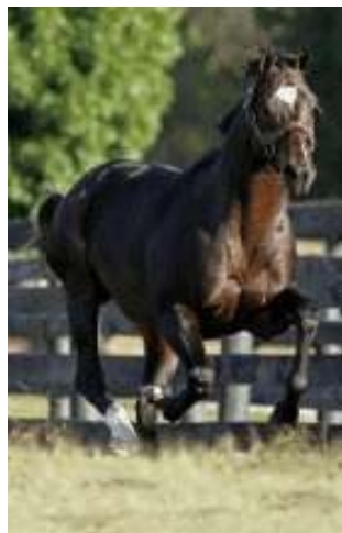
Hook and Ladder

Sitting in the front row of the sales pavilion, trainer Bob Baffert landed a filly from the first crop of the Dixieland Band stallion Hook and Ladder for $325,000. Baffert signed the ticket for an undisclosed partnership. Consigned as hip 71, the filly, a relatively late May 17 foal, is out of the winning Gaye's Blossom (Thirty Six