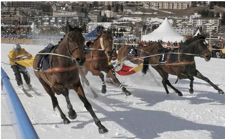
St. Moritz - White Turf Festival