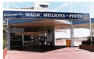
Magic Millions photo

SALE A filly by Elusive Quality set a record of A$365,000 for a yearling at the Magic Millions Perth Sale's opening session yesterday. The previous high