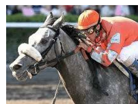
Swap Fliparoo