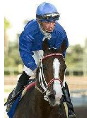
Selvatica