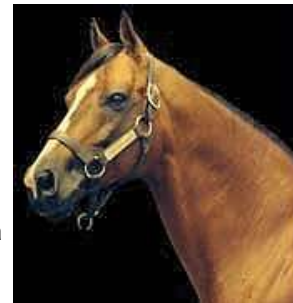
Northern Baby (1976-2007)