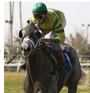
Honey Ryder

Four-for-seven at Gulfstream Park and five-for-seven at 11 panels, Honey Ryder takes on the boys for the first time in her career. The six-year-old won back-to-back runnings of the GIII Orchid H. going a mile and a half over this course in 2005 (when it was a Grade II) and 2006. She also captured the May 27 GII Sheepshead Bay H., July 15 R.G. Dick BC H. and Oct. 7 GI Flower Bowl Invitational S. last season, and ended the campaign with a solid third-place finish in the Nov. 4 GI Breeders' Cup F/M Turf. She is the second choice to open 2007 in the winner's circle. Fellow gray Revved Up could prove the one to beat. The nine-year-old has only gotten better with age. He was first or second in all eight starts in 2005 and won five of his six outings last season, reeling off wins in the Sept. 9 Bob Harding S. at Monmouth, Oct. 6 GIII Sycamore BC S. at Keeneland and Nov. 11 Bonnie Heath Turf Cup H. to