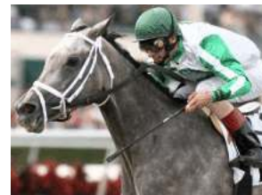
Wait a While

Wait a While earned championship honors last season with a string of four straight open-lengths victories in graded stakes company. The gray filly won the GIII Sands Point S., the GI American Oaks, the GII Lake Placid S. and the GI Yellow Ribbon S., but had the