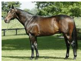
Empire Maker

Boasting the strongest commercial appeal since the 2004 class of Giant's Causeway, Fusaichi Pegasus, et al, this year's group of freshman sires is led by a trio of talented Grade I winners with pedigrees for the Classics. Two of them--Horse of the Year Mineshaft (A.P. Indy) and GI Belmont S. hero Empire Maker (Unbridled)--began their stud careers at a fee of $100,000, while GI Breeders' Cup Juvenile winner and champion two-year-old colt