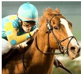
Belgravia