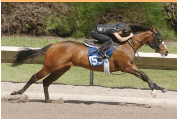
Last year's world-record, $16-million The Green Monkey