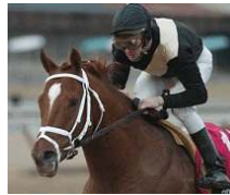
Cowtown Cat

You can add another GI Kentucky Derby contender to Todd Pletcher's stacked hand. Cowtown Cat (Distorted Humor), a $1.5-million BARMAR juvenile purchase, rallied to a 2 1/2-length victory over Wafi City (E Dubai) in yesterday's GIII Gotham S. at the Big A. Even-money favorite Summer Doldrums (Street Cry {Ire}) had to settle for third. cont. p6