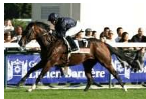
Holy Roman Emperor

Winner of last season's G1 Phoenix S. and G1 Grand Criterium, Holy Roman Emperor was expected to be trainer Aidan O'Brien's best prospect for the 2000 Guineas in May. "We were shell shocked about it here because Holy Roman Emperor was our best horse," said Aidan O'Brien, explaining his thoughts on the three-year-old's sudden retirement. "The more I tried to persuade him not to retire him, the more he was convinced he had to retire him. The boss has his clients there and has to take care