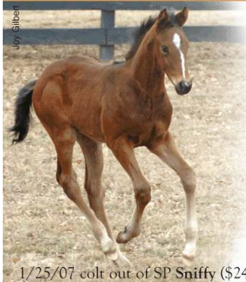
1/25/07 colt out of SP Sniffy ($247,570)

First foals are arriving by blazing fast multiple G2 SW who sped 1:08 1/5 coast to coast.