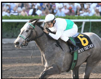
Click here for video

Including Undefeated G2 Winner FOREVER TOGETHER Winner of the G2 Forward Gal S. yesterday