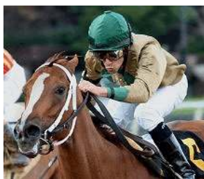
India Coady photography

India concluded her 2006 campaign with back-to-back victories; winning the Sept. 10 Without Feathers