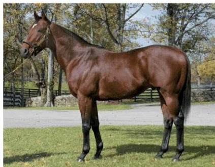
Equibase® Speed Figure: (ESF) tells you how fast a horse has been running in its past races with a single number. Its sophisticated algorithms are based on the horse's actual time in combination with other factors, such as the condition of the track.

CRYPTOCLEARANCE DEVIL HIS DUE DOWN THE AISLE KELA PIKEPASS