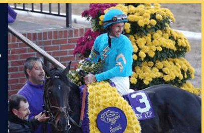
SQUIRTLE SQUIRT wins BC Sprint-G1