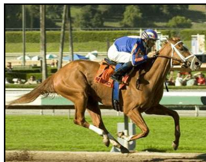
Click here for video

Dominates by 5 1/2 lengths in the Grade I Santa Anita Oaks