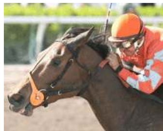
Miss Shop