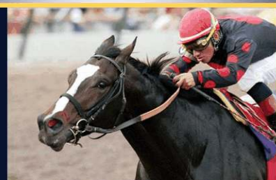
ARTAX wins Breeders' Cup Sprint-G1

Stonewall Farm STALLIONS Building Thoroughbred Foundations