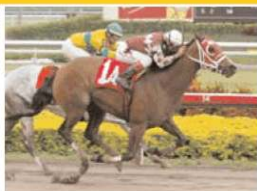
Recent Gulfstream winners Duveen & Casablanca Babe