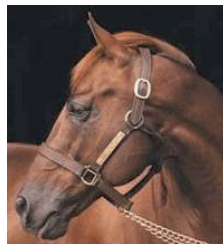
Crafty Prospector