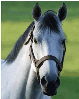
Champion & G1 Winner at 2...Smoke Glacken