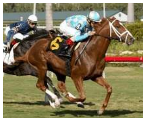
Smart Strike's son English Channel

In other words, we are talking about a stallion who, despite being 15 years old, almost certainly has his best years ahead of him--and he has already given us performers of the calibre of English Channel, Shadow Cast and Soaring Free. With 35 percent of his progeny earnings to the end of last year having come on turf, Smart Strike also holds plenty of appeal to Europeans, especially as he has enjoyed group success with Saranac Lake in Ireland and Tungsten Strike in Britain, from a limited number of runners.