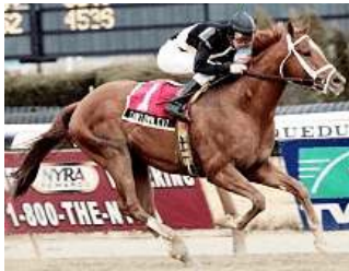
Last year's $1.5 million topper Cowtown Cat

With the sale season for juveniles in training in full swing, Barretts hopes the depth of the catalog will translate into money in the coffers at today's March Selected Two-Year-Olds in Training sale held at Fairplex in Pomona, California. Barretts officials are cautiously optimistic that the March fixture will hold its own against other two-year-old sales earlier on the calendar based on the re-appearance of many of the principal figures well known on the sales scene. Buying teams representing titans Coolmore and Darley were