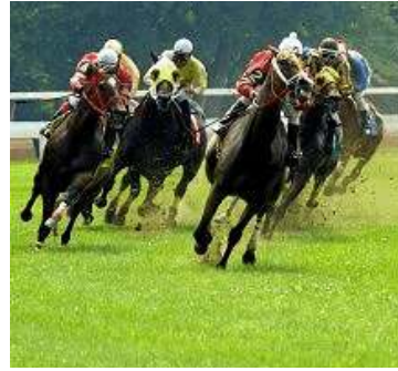
Turf Racing at River Downs riverdowns.com

CRADLE MOVED TO THE LAWN River Downs track officials, aiming to attract hopefuls for the newly inaugurated $1-million GI Breeders' Cup Juvenile Turf, announced yesterday that the track's signature race, the Miller Lite Cradle S., will now be run on the grass.