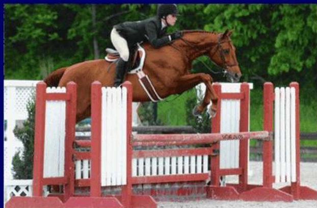
"Buster" was rescued by the TRF from New Holland in 2002.