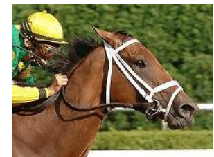
Cotton Blossom