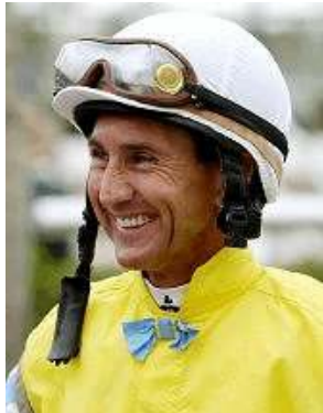
Jerry Bailey

Former jockey and ESPN horse racing analyst Jerry Bailey as well as NBC each received nominations for the 28th annual Sports Emmy Awards, it was announced yesterday.