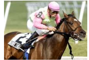
Adore The Gold