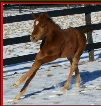
'07 f. Kela-Wimpy Skimpy

The second Under-Tack Show for the OBS March Sale of Selected Two-year-old in Training is set for today and tomorrow, with both sessions beginning at 9:00 a.m. The March sale, which is scheduled for Mar. 27 and 28, has 520 youngsters catalogued. Juveniles set to work today (hip 1-260) will be sold Mar. 27, while horses selling Wednesday, Mar. 28 (hip 261-520) will breeze tomorrow. The Adena Springs Sale Under Tack Show is scheduled for Mar. 25, beginning at 8:30 a.m. The Adena sale will be conducted Monday, Mar. 26 at 5:00 p.m. For complete results from the first breeze show Mar. 17, go to www.obssales.com .