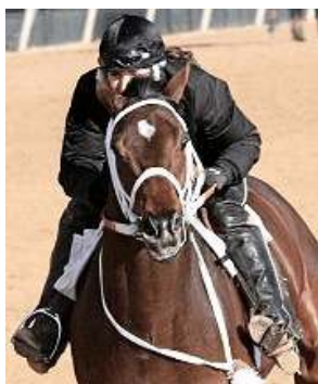
Hard Spun

A full field of 12 is set for this afternoon's running of the GII Lane's End S. over the Polytrack at Turfway Park--and the chalk eaters best beware. Not since Event of the Year took the race in 1998--when it was run as