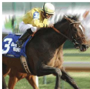
Lady Joanne by Orientate winning the Golden Rod-G2 at Churchill on 11-25

Consigned by Hartley/De Renzo Thoroughbreds LLC, agent The co-highest-priced pinhook of the sale as a $275,000 FTKJUL yearling, the gray is from the commercially successful family of the hard-knocking racemare Roll Over Baby. That mare has produced the $1.1 million SW & MGISP Value Plus (Unbridled's Song); the $2 million Morocco (Brocco); and Laptop, the dam of this fellow. Hip 15 breezed an eighth in :10 1/5 at the Mar. 17 show ( video ).