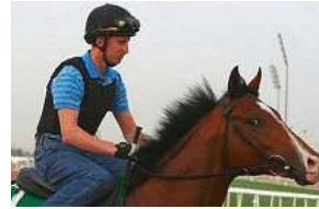
Sir Percy Dubai Racing Club

English champion Sir Percy (GB) (Mark of Esteem {Ire}) will look to start his 2007 season with a bang when he breaks from post seven in Saturday's G1 Dubai Sheema Classic at Nad al Sheba. The four-year-old won five of his first six starts, including the G1