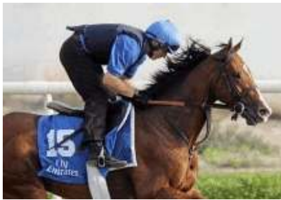
Discreet Cat