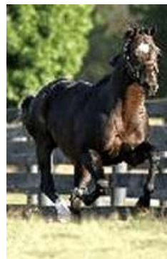
Hook and Ladder