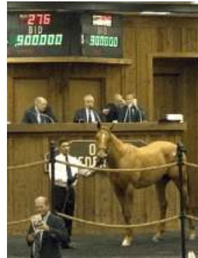
Hip 276, yesterday's topper by Forest Wildcat