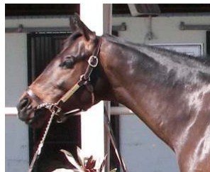
Hip 480, by A.P. Indy