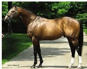
Stormy Atlantic