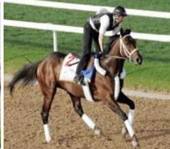
Invasor (Arg)