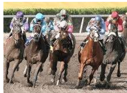
Scat Daddy (second from left)

five graded stakes at three tracks yesterday, topped by a professional performance by Scat Daddy (Johannesburg) in the $1-million G1 Florida Derby at Gulfstream. "It was a little disappointing [for the stable] in Dubai, but