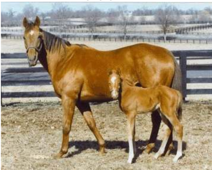
2004 Horse of the Year Azeri with her first foal, an A.P. Indy colt.