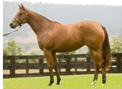
Forensics as a yearling inglis.com.au

THE SLIPPER FITS FORENSICS The pre-race discussion centered on two premises: that the Melbourne juveniles were superior this season and the G1 Golden Slipper S. winner would ultimately emerge from among the early spring juvenile winners. But Forensics (Aus)