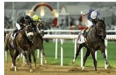
Kelly's Landing holds off Friendly Island

and stayed well to be third," jockey John Murtagh said.