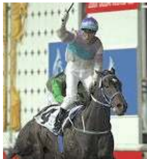
Vengeance of Rain A Watkins