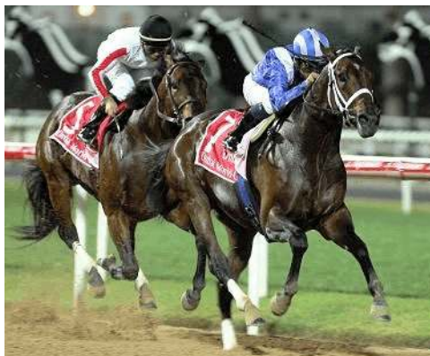
Invasor tops Premium Tap

Premium Tap made Invasor earn every cent of the $3.6-million winner's share. "The winner was too good," Desormeaux admitted. "He [Premium Tap] was a little spread out [in the gate]; they had him blindfolded. I was like, wait, wait, wait. I pulled the blindfold off and throw in out the back. I no longer get a hold and we're gone. That was the only thing. I enjoyed the ride. Turning for home, I was looking behind me. He set sail. He (Invasor) couldn't get me until at least the 3/16, then ate me up. The winner is a freak."