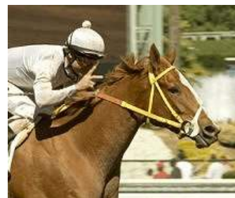
Magnificence

Magnificence made a memorable debut Mar. 11 at Santa Anita, looking hopelessly beaten on the backstretch before doing her best Silky Sullivan impression