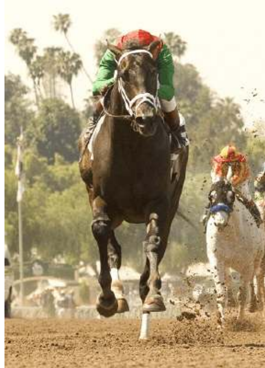
From Saratoga yearling topper to Beyer figure topper.

Fairbanks made the G3 Tokyo City H. win number 4 in 6 dirt starts.