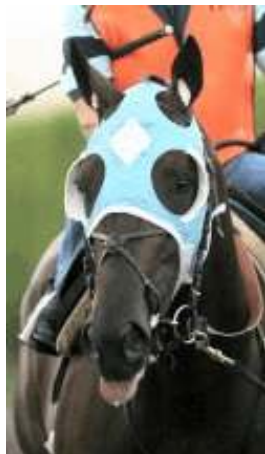
Nobiz Like Shobiz

NOBIZ SHARP IN PREP FOR WOOD Turning in his last serious work at Gulfstream Park before shipping