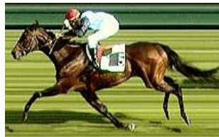
Boris de Deauville