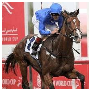
Discreet Cat A Watkins

Godolphin's Discreet Cat (Forestry), who finished last in Saturday's G1 Dubai World Cup, was suffering from a throat infection, according to a statement on www.godolphin.com . The previously undefeated four-year-old underwent a thorough veterinary exam at Al Quoz Stables Sunday morning that uncovered the problem. The statement read, in part, "An endoscopic examination of his respiratory tract...revealed an obstructive granulomatous mass within his throat, in addition to significant swelling of the underlying throat wall, as a result of an infective process.