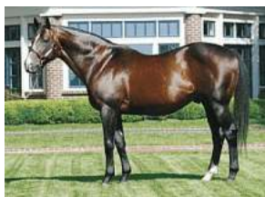
A.P. Indy

A.P. INDY GETS 100 TH STAKES WINNER Two-time leading sire A.P. Indy (Seattle Slew--Weekened Surprise, by Secretariat) was represented by his 100 th stakes winner when A.P. Arrow won Saturday's GIII Skip Away H. at Gulfstream Park. With 12 crops of racing age, the 1992 Horse of the Year has sired 59 graded stakes winners to date, including five champions. A.P. Indy's most recent Eclipse winner, Bernardini, was crowned last year's champion three-year-old after collecting five graded stakes in 2006, including the GI Preakness S., GI Belmont S. and GI Jockey Club Gold Cup. The 18-year-old A.P. Indy, who stands for $300,000 at Lane's End in Lexington, currently ranks second on the General Sires List for 2007 with $2.3 million in earnings, led by MGISW Rags to Riches and MGSW Master Command.