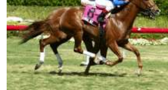
Ashkal Way

Aug. 26, GII Kelso BC H. Sept. 30 and GI Citation H. Nov. 24. Sent off the odds-on