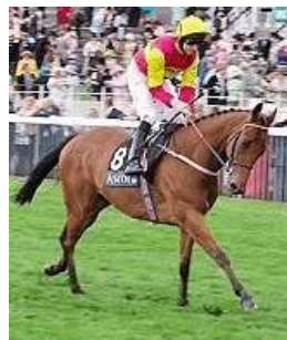
Fayr Jag

Mr. Greeley enjoyed another successful year in 2006 and supplies an eye-catching colt offered by Powerstown Stud as hip 7 , who is out of the dual