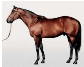
Zabeel's son Reset

The highest-priced foal from Reset's first British crop was out of a Danehill mare, and there is already plenty of evidence that the Danehill and Sir Tristram lines