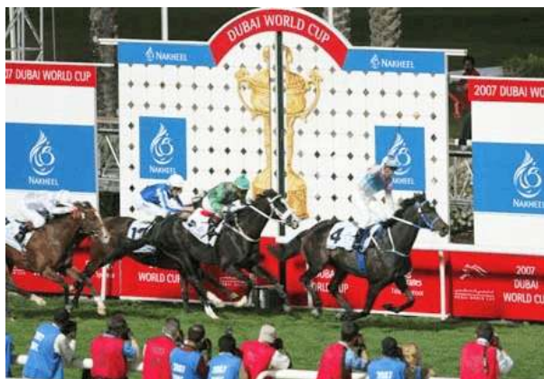
Vengeance of Rain takes the Sheema Classic

This classically bred colt never won a major prize and finished only 11th behind Cannonade when sent from France to challenge for the 1974 Kentucky Derby, yet he founded a dynasty during his time at the world famous Cambridge Stud in New Zealand. Forty-five of Sir Tristram's sons and daughters became Group 1 winners, including the Australian Guineas winner Zabeel, and they helped him become champion sire six times in Australia. Sir Tristram's outstanding achievements seemed unlikely to be surpassed until the phenomenal Danehill arrived on the scene. Coincidentally, these two major forces appear as the grand-sires of Vengeance of Rain, the Hong Kong champion who proved too good for an international field in Saturday's Dubai Sheema Classic.