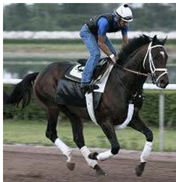
Any Given Saturday