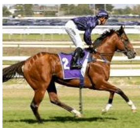
Churchill Downs www.bluegumfarm.com.au