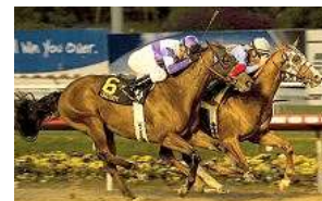
Liquidity (outside)