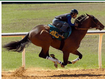
Hip 413

$325,000 - 6th highest price at OBS MARCH: Hip 413 - STEPHEN GOT EVEN-DATSAFACT C.