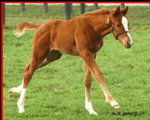
Ch Colt Kela - Sigatoo

"This colt is a standout... we had a visitor pick him out of the field last week and they wanted to buy him on the spot."