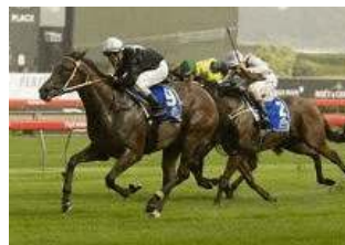
Inglis grad Carmarilla inglis.com.au

EMPIRE MAKER DESTINED Juddmonte (859) 272-7629 www.juddmonte.com