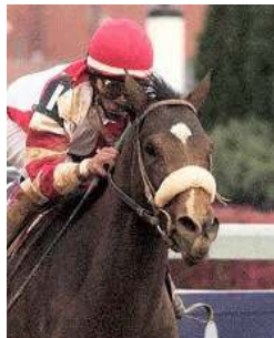
Round Pond