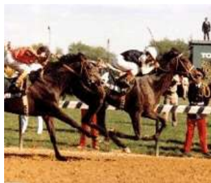
Pleasant Colony

It's true that Pleasant Colony was a prolific source of horses which took some time to reach full maturity. For example, Behrens didn't record his first Grade I success until he was five and neither did Pleasantly Perfect or Shared Interest (the dam of Forestry).