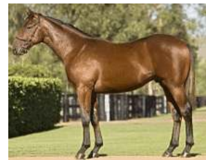
Lot 344 inglis.com.au

Encosta de Lago (Aus) , the leading sire by average for the first session, continued to record sparkling results after fireworks in the sale ring yesterday. Trainer Leon