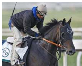
Great Hunter Horsephotos

Jim Tafel's champion Street Sense (Street Cry {Ire}) has drawn post four in Saturday's GI Toyota Blue Grass S. at Keeneland, heading a cast of seven that also