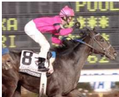
Birdbirdistheword